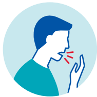
Person with Cough