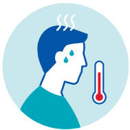
Person with Fever